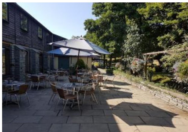
Barn Café Patio tables