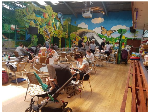
Bo Peep's Café seating area