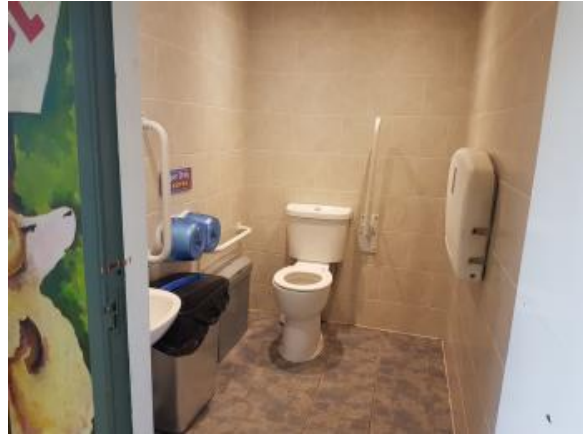
Accessible toilet in Ewetopia