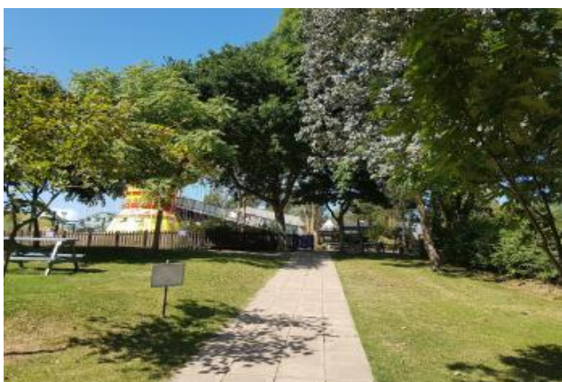
Pathway to The Twister Ride