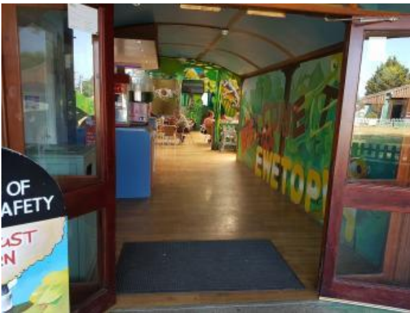
Entry doors to Ewetopia Play Zone