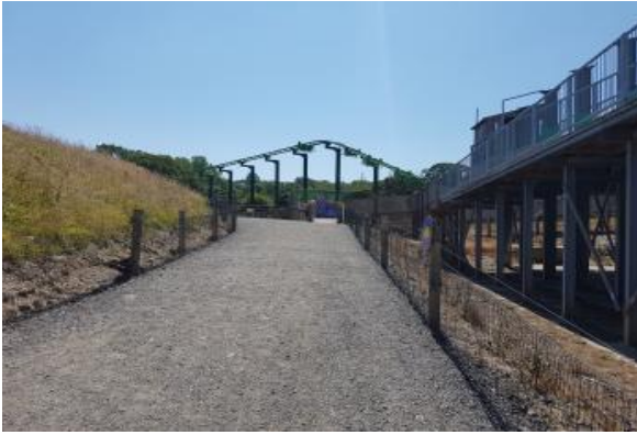
Path from bridge to roller coaster