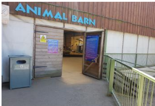
Entrance to the Animal Barn