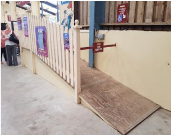
Ramp wheelchair access