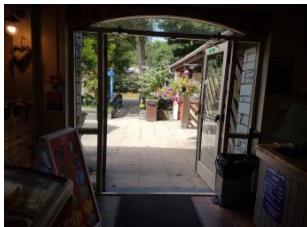
Double doors Reception to park