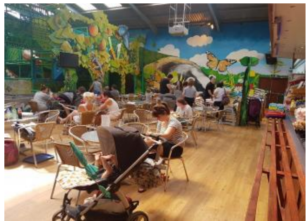
Cafe seating area