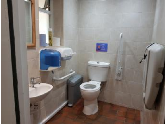
Accessible toilet at Reception