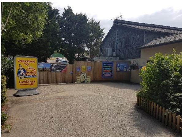
Pathway from disabled parking to main entrance