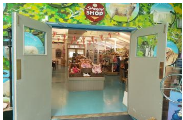
Entrance to the shop