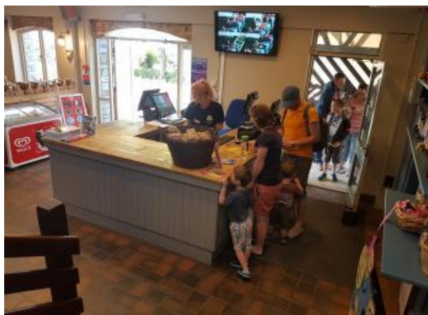
Reception and Information desk