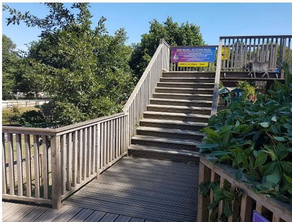
Steps to Swan Pedalos