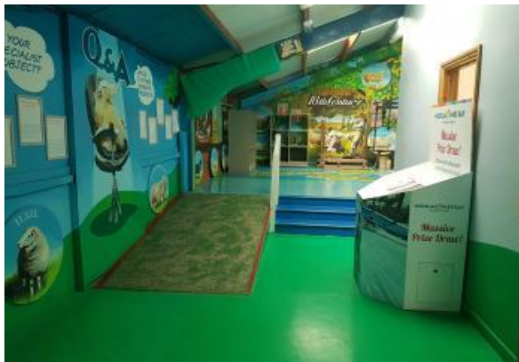
Ramp to shop