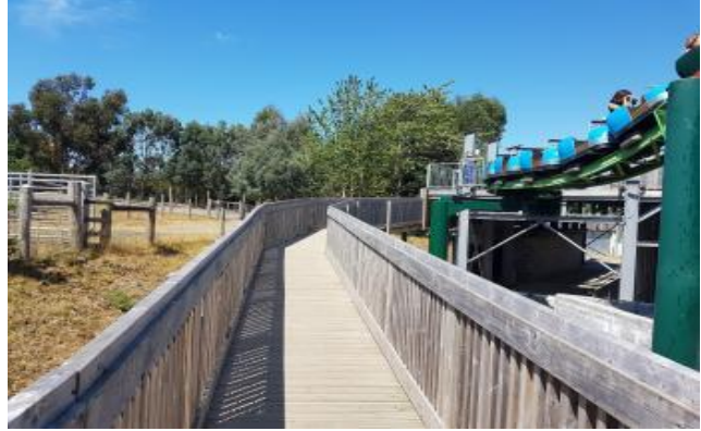
Wheelchair access route