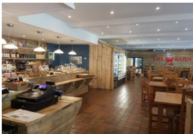
The Barn Cafe