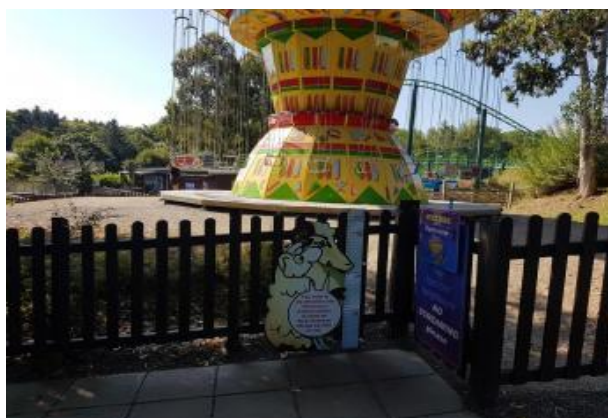
The Twister entry gate