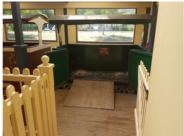
Wheelchair carriage on train