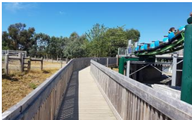
Wheelchair access route