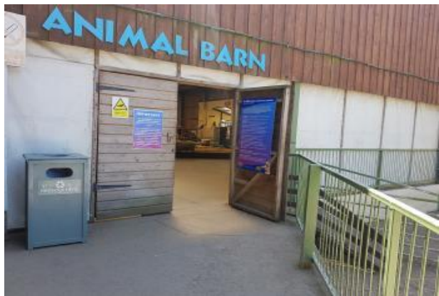
Entrance to barn