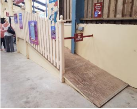
Ramp wheelchair access