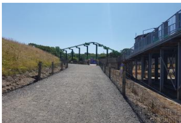
Path from bridge to roller coaster