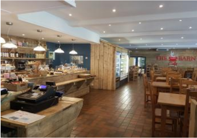
The Barn Cafe Interior