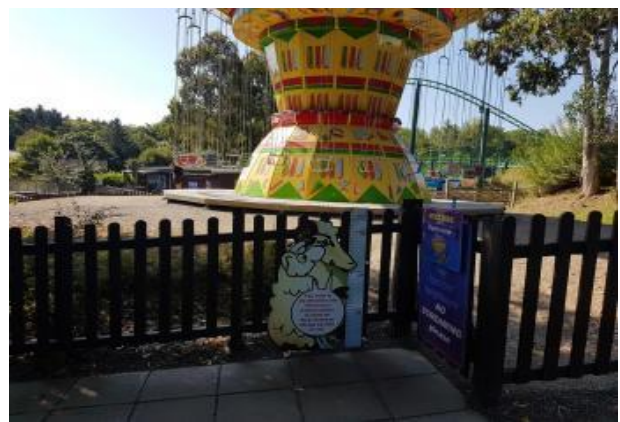
Twister Entry Gate