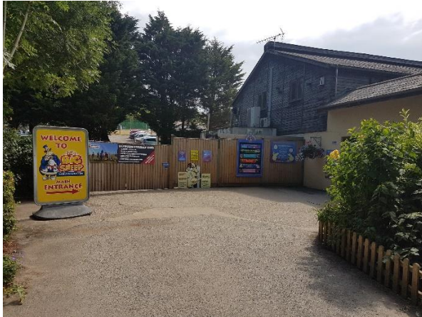
Pathway from disabled parking to main entrance