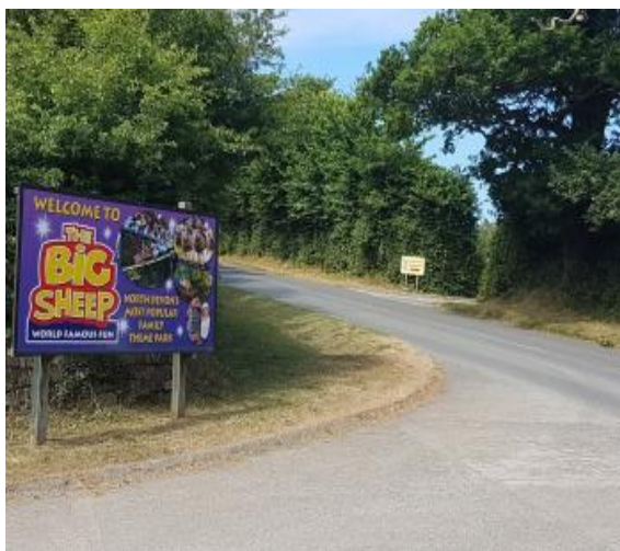
Bus stop by main car park