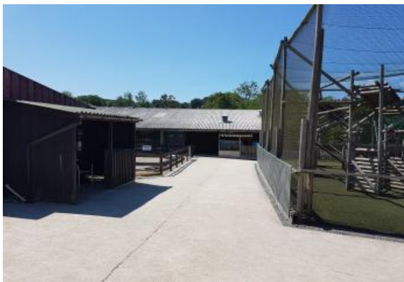
Pathway leading to Pony rides