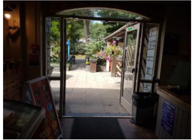
Double doors from reception to park