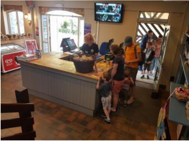
Reception area and information desk