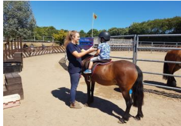
Pony Ride Arena