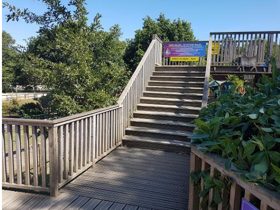
Steps to Swan Pedallos