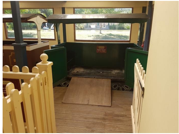
Wheelchair carriage on train