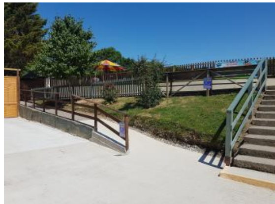
Accessible route to Duck Arena