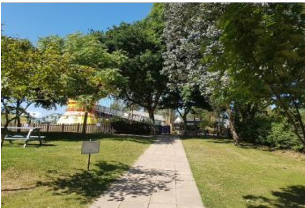
Pathway to Twister Ride