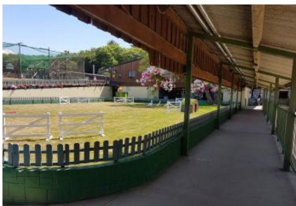
Covered walkway and viewing area