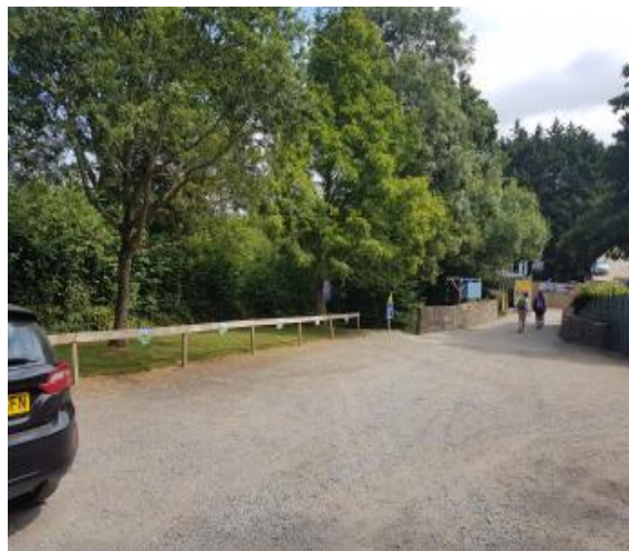
Disabled parking spaces