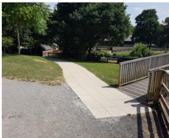
Path from reception to bridge