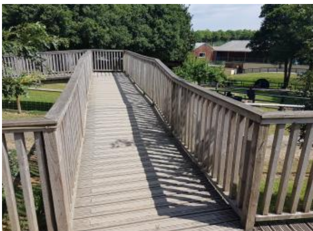
Bridge from path to Roller Coaster